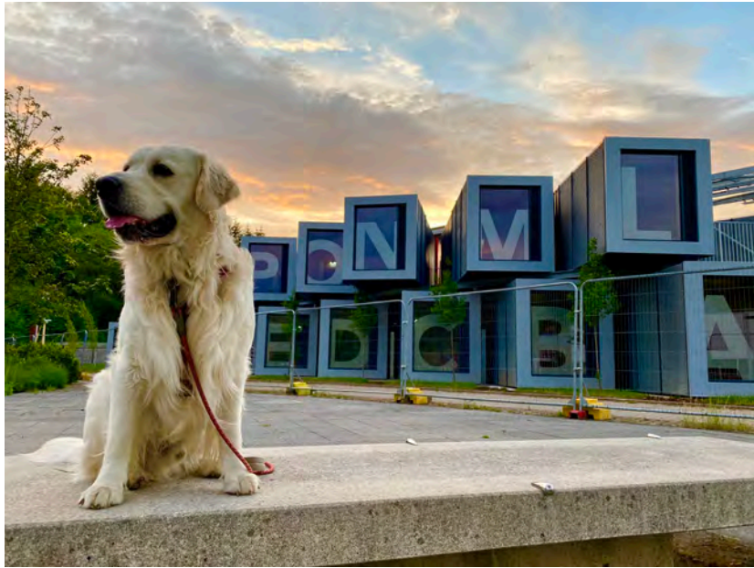
Cover Photo: "Box Units", Ebbw Vale.